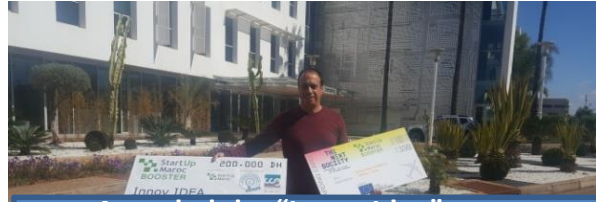
Awarded the "Innov Idea" grant from StartUp Maroc Booster 2018 20.000$