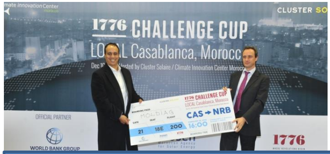
Reaching the final at Washington DC of the 1776 challenge cup