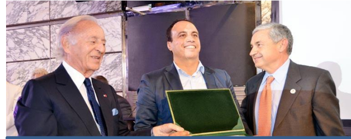
First prize of the AFRICAN ENTREPRENEURSHIP AWARD BY THE BMCE 2016 150.000$